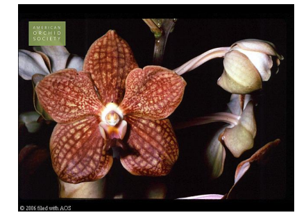
Vanda Motes Nutmeg 'Redland Spice' HCC/AOS (78 points) ( Vanda bensonii x Vanda Queen Kaumana)

V. Motes Nutmeg ( V. bensonii x V. Queen Kaumana), is a free flowering, characteristic imparted by V. sanderiana . It is produces long, erect inflorescences of well-held flowers on relatively small plants. The clear tessellated pattern of the color is a pleasant bonus. The exceptional substance of these flowers gives them keeping qualities that usually last until the flowers on another inflorescence are ready to open.