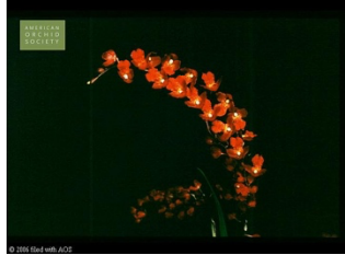
Leomesezia Lava Burst 'Puanani' AM/AOS (80 points) Leomesezia Mini-Primi x Rodriguezia lanceolata

Gomesa sarcodes contributed with nice open shape and putting some yellow probable as base color combined with pleasant dots. Backcrossing Rdza. lanceolata outcome a deep red color.