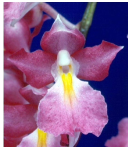
Rodriguezia Burgundy 'Cushine' HCC/QOS

Rdza. Burgundy inherited most of its trait from Rdza. venusta and the lip is the greatest improvement of this combination.