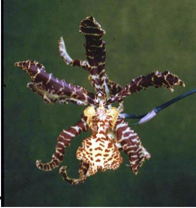
Psychocentrum Kristi Leigh 'Lauralin' JC/AOS

Two striking flowers on one inflorescence; sepals and petals yellow-green, strong mahogany-brown bars; lip bright yellow, distally bi-horn structure, even pattern red-brown spotting; lateral lobes brilliant yellow, light red-brown spotting, substance firm, texture crystalline. Commended for deep marking color on segments.