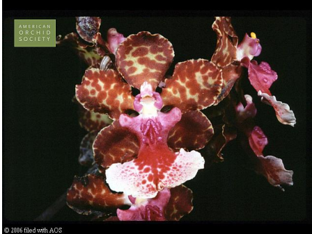
Oncidium haematochilum 'Larkwood' HCC/AOS (77 points) Oncidium lanceanum x Oncidium luridum

Fourteen flowers on one inflorescence; dorsal sepals slightly cup; sepals and petals chartreuse, maroon barred-spotted brown; lip white, centrally cranberry, inverted triangle shape, finely spotted cranberry, side lobes, crest, column wings dark purple; mid-lobe pale pink; substance hard; texture matte.