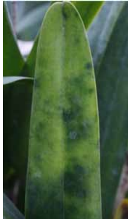
Cattleyas grown in bright light with insufficient magnesium may exhibit mottling indicative of chlorophyll damage