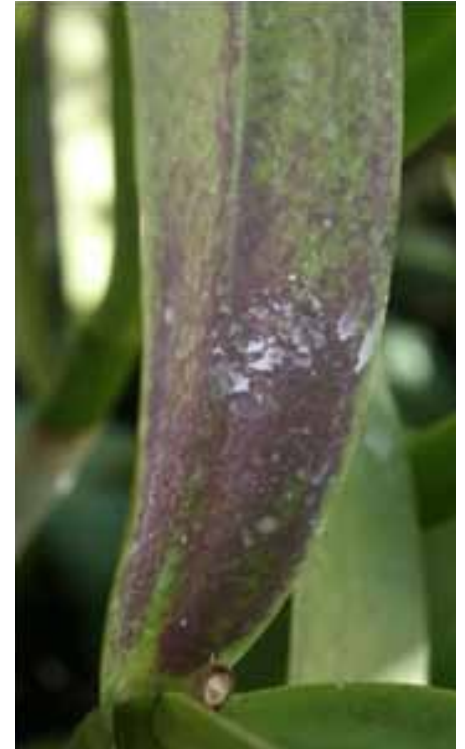
Leaves may turn a reddish purple after exposure to cold if they are magnesium deficient. Correct this with a megadose of Epsom Salts (1 tsp/gal).