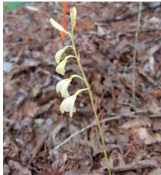
Yellow Hexalectris warnockii

the survey will be on July 21 when, we will break into teams and collect each of the ribbon tags and measure the height of each find. This information