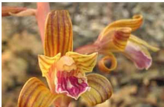
Hexalectris spicata