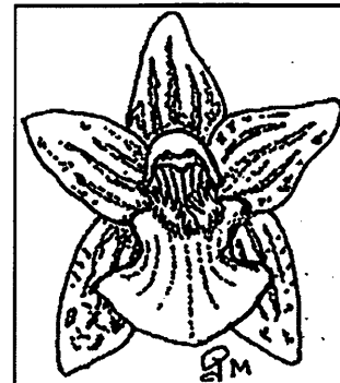
Galeottia burkei front view

Description: Galeottia burkei is a terrestrial species growing in boggy, acid soils. The pseudobulbs are narrow with 2-3 erect, tough, oblanceolate, acute to acuminate, petiolate leaves 30-45 cm long. The inflorescence is racemose, about 60 cm tall, with up to 6 fleshy flowers. Flowers are variable in color intensity, green with heavy brown marks on sepals and petals, very similar to Galeottia jorissiana . The lip is white and the basal crest is heavy, with many points, white with some red-purple marks. The anther cap is yellow with a red rostellum. Both sepals and petals are lanceolate, acuminate. Lip is 3-lobed at the base, pubescent on margins of the midlobe, acuminate, erose on the front margin, fimbriate; callus is several-ridged, fleshy, broad across the base of the midlobe.