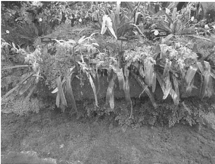
Paph Michael Kooporwitz, WOC's Grand Champion Plant.

Remember, Training now begins at 11:30 AM, Judging at 1 PM, Richland College Horticulture Building, second Saturday of each month; visitors welcome!