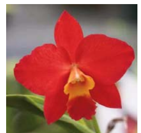
Little Bright Circle