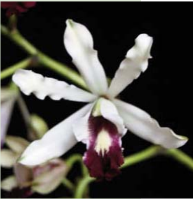
Myrmecophilia albopurpurea 'Judy' (species)

There will be an auction of orchids and related items next month, July 10, bring donations and/or come to bid and purchase.