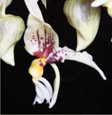
Stanhopea Assidensis 'Trudy' (tigrina x wardii)