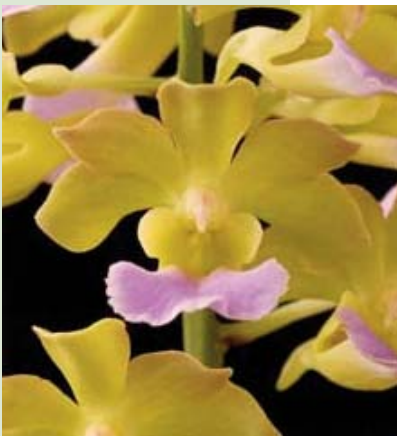
Christenstylis Kedah Bella 'Reyna'