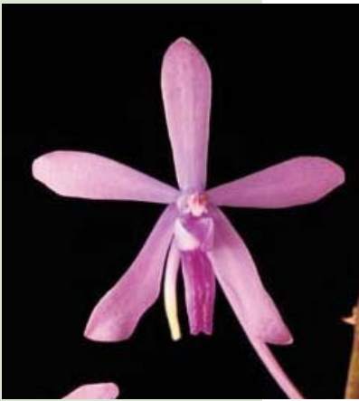
Darwinara Charm 'Blue Pacific'