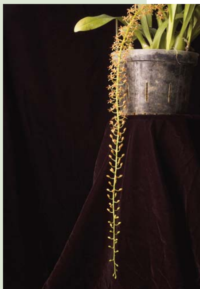
Dendrochilum magran 'Daniel'