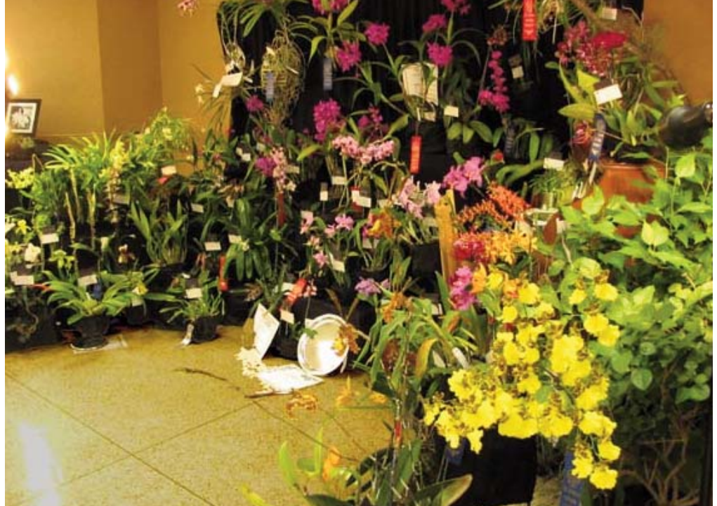
GNTOS Exhibit at the Fort Worth Orchid Society Show