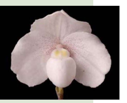
Ascocenda Piswong 'Kiilani'