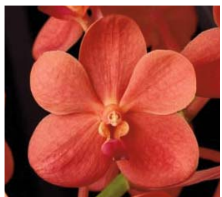
Ascocenda Piswong 'Kiilani'