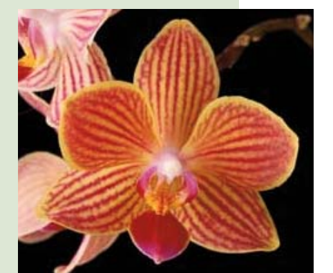
Dtps. Chingruey's Goldstaff 'M'