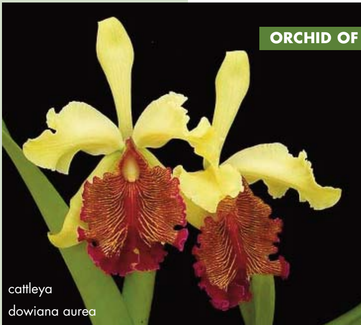
cattleya dowiana aurea