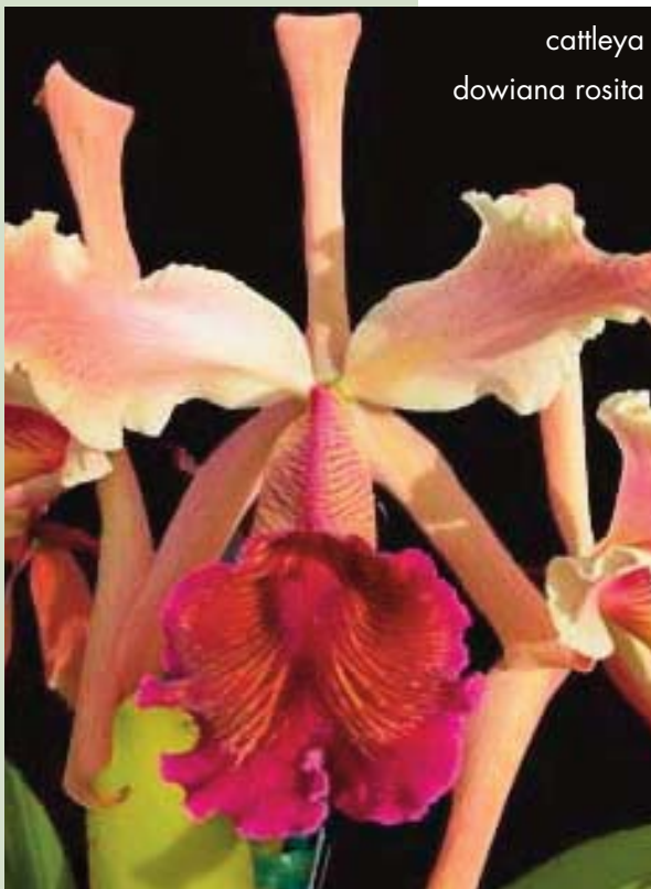
cattleya dowiana rosita