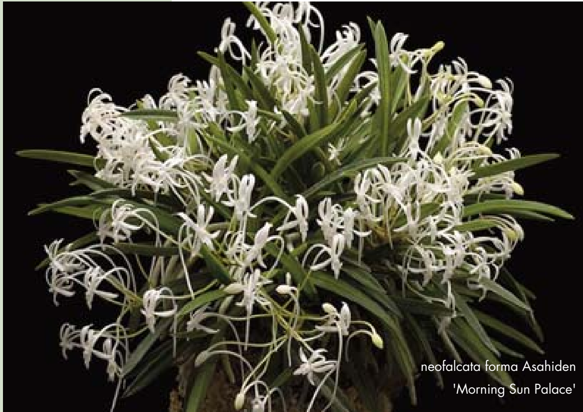
neofalcata forma Asahiden 'Morning Sun Palace'