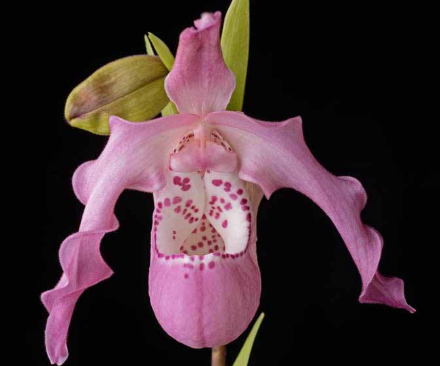
Phrag. (boisserianum x kovzchii)