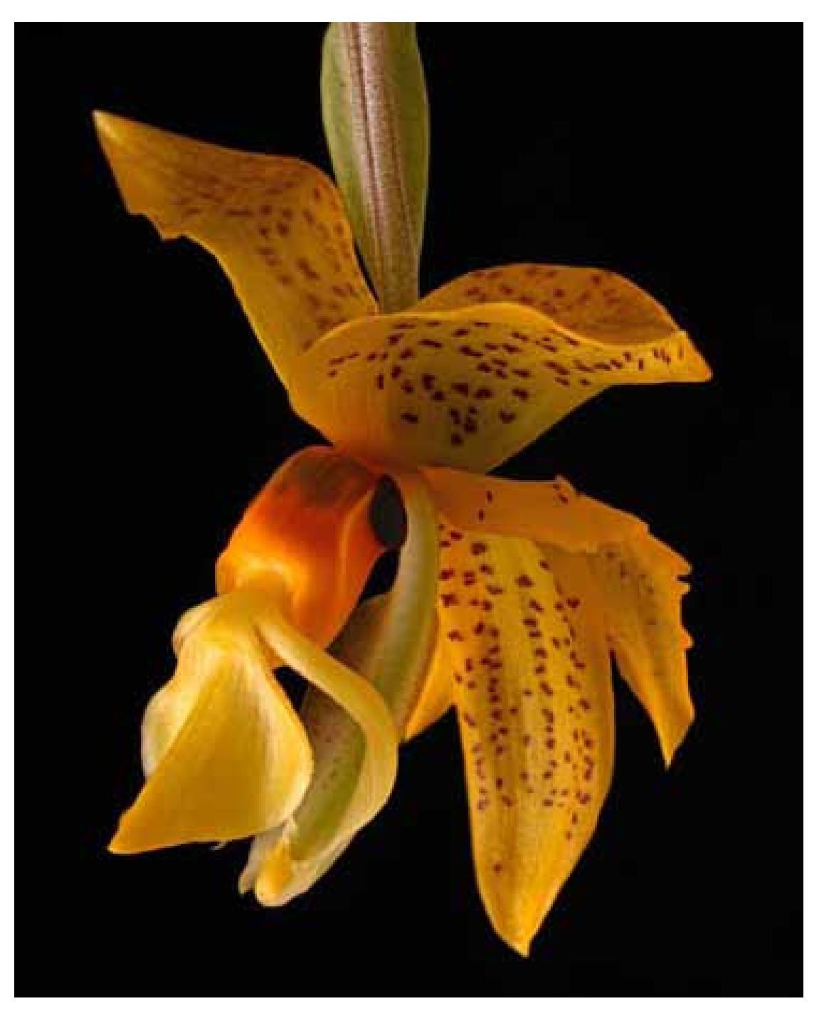
Stan. Wardii 'Edwin Boyette' presented for consideration.

11am. Everyone is welcome to bring plants or to just watch and learn.