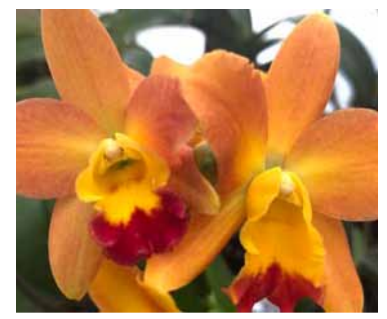
Pot. Dream circle 'lone jack ' X Pot. California Queen 'Red Angel'