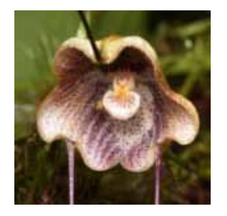
Endangered Hirtz' Phragmipedium