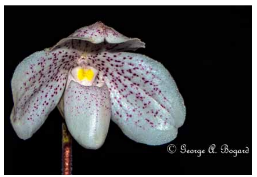
Paph. (Ang-Thong alba 'In Charm' X Niveum alba 'Pathone') — George Bogard