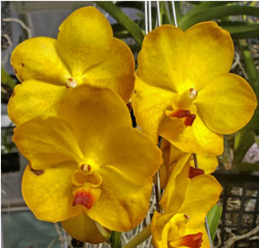
Vandachostylis Conference Gold